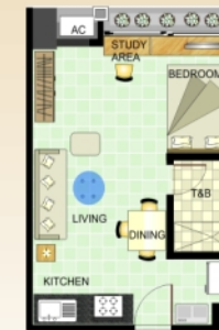
Studio Unit approx. 31 sqm