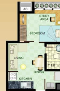
1 Bedroom unit approx. 34 sqm