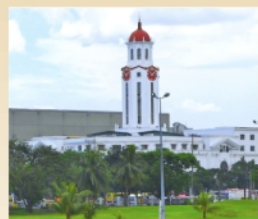
Manila City Hall

Malls • Government offices • Schools & Universities • Business District