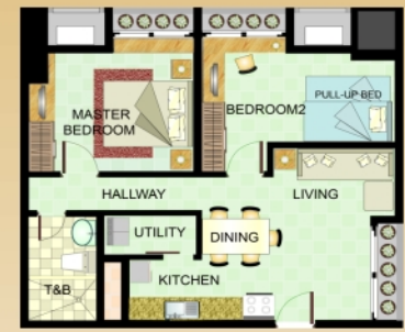
2 Bedroom unit approx. 58.5 sqm