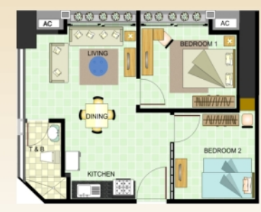
2 Bedroom unit approx. 59 sqm